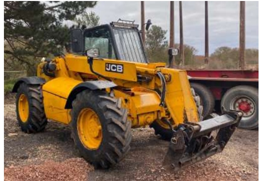
The Lorry & Tele-handler donated to the Kazunzu Village of Hope