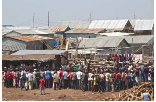
Island community dispensaries play a significant role providing healthcare

Although medical services on the islands are limited, a small number of dispensaries mostly run by Africa Inland Church Tanzania, are strategic locations where community members and visiting fishermen can receive medical attention. Whilst the