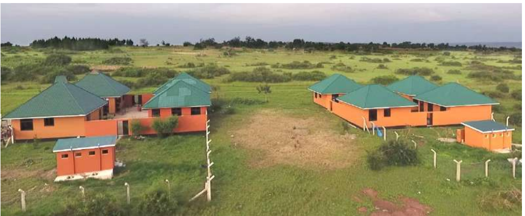
The first 8 homes at Kazunzu have now been built and families have moved in.