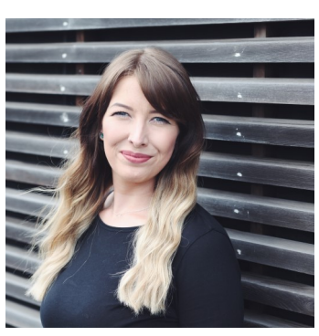
Filidh Programme Coordinator